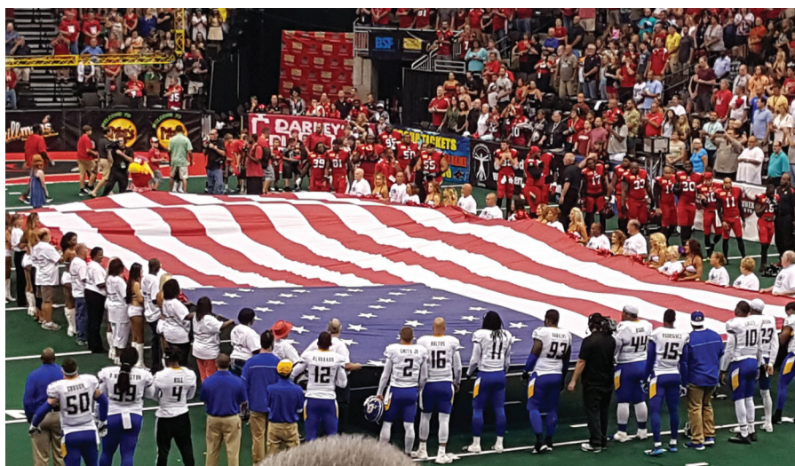
30 election poll workers held a large American flag during the singing of our National Anthem.

Voter education, an ongoing effort of our office, can take many forms. One voter education venue of note is our sponsorship of Voter Appreciation Night with the Jacksonville Sharks, our local arena football team. 2017 marked our second year working with the Jacksonville Sharks. Last year over 9,000 fans attended our voter appreciation game. Elements of this entertaining event included: